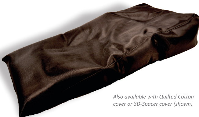
Also available with Quilted Cotton cover or 3D-Spacer cover (shown)