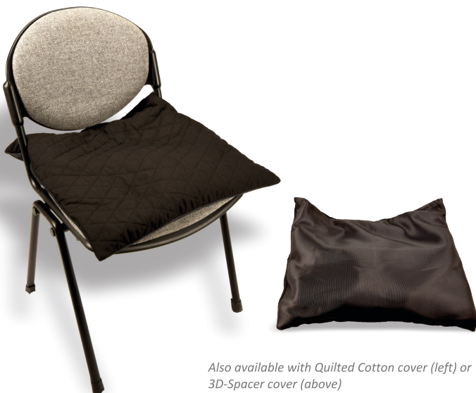
Also available with Quilted Cotton cover (left) or 3D-Spacer cover (above)